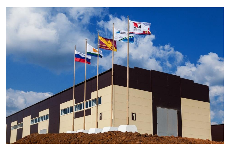
Production buildings, motor access road