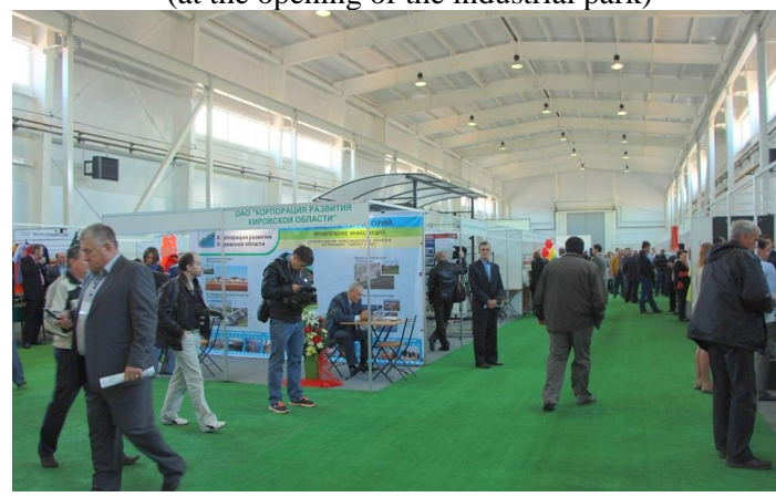
Production building, inside view