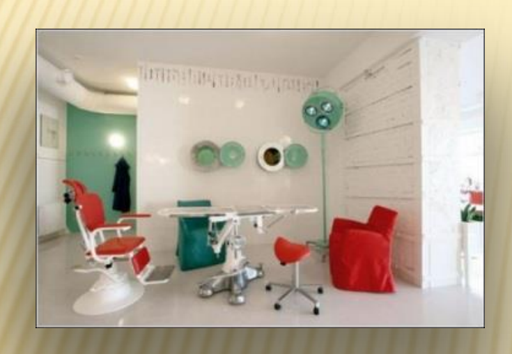
PROJECT «DOCTOR NEARBY»