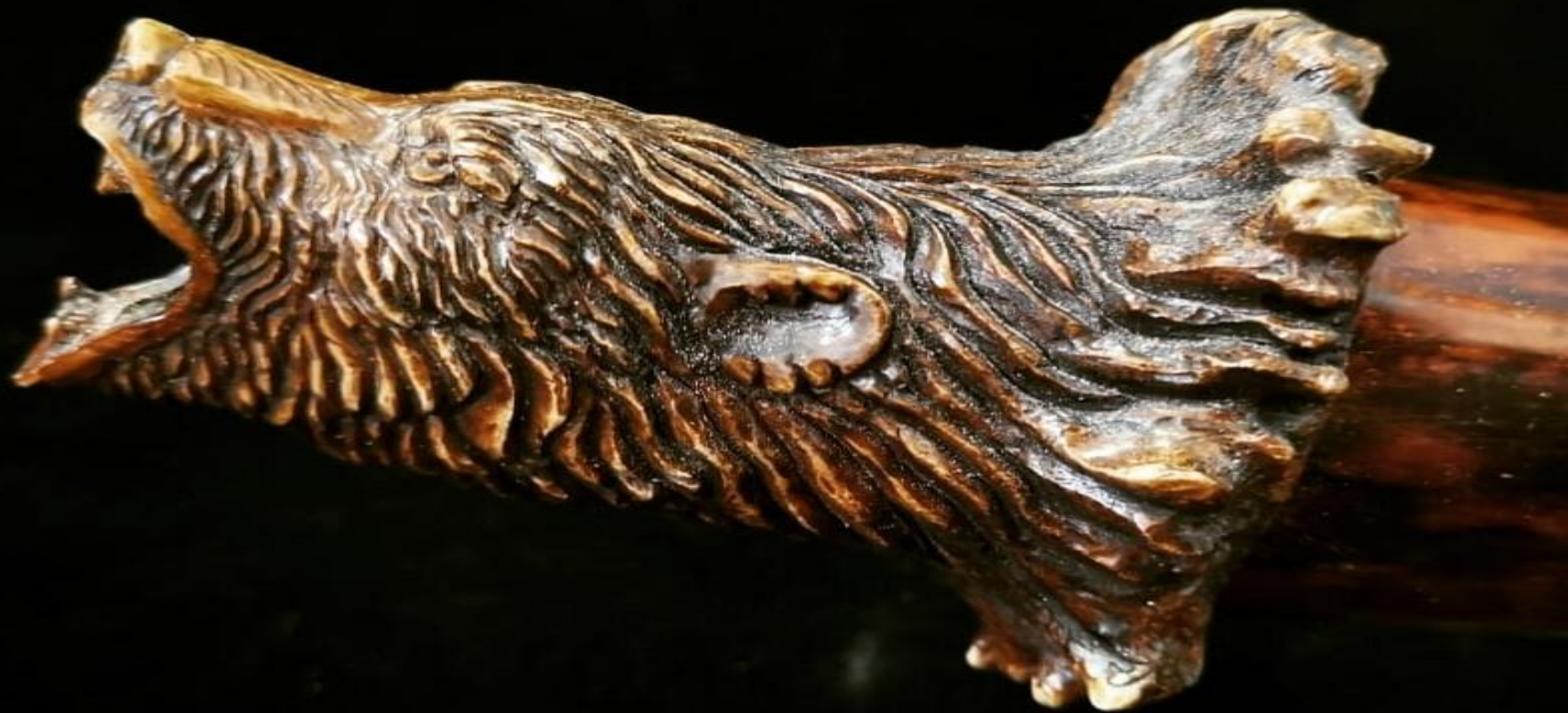
"Yakutian bone carving factory" Tusku LLC