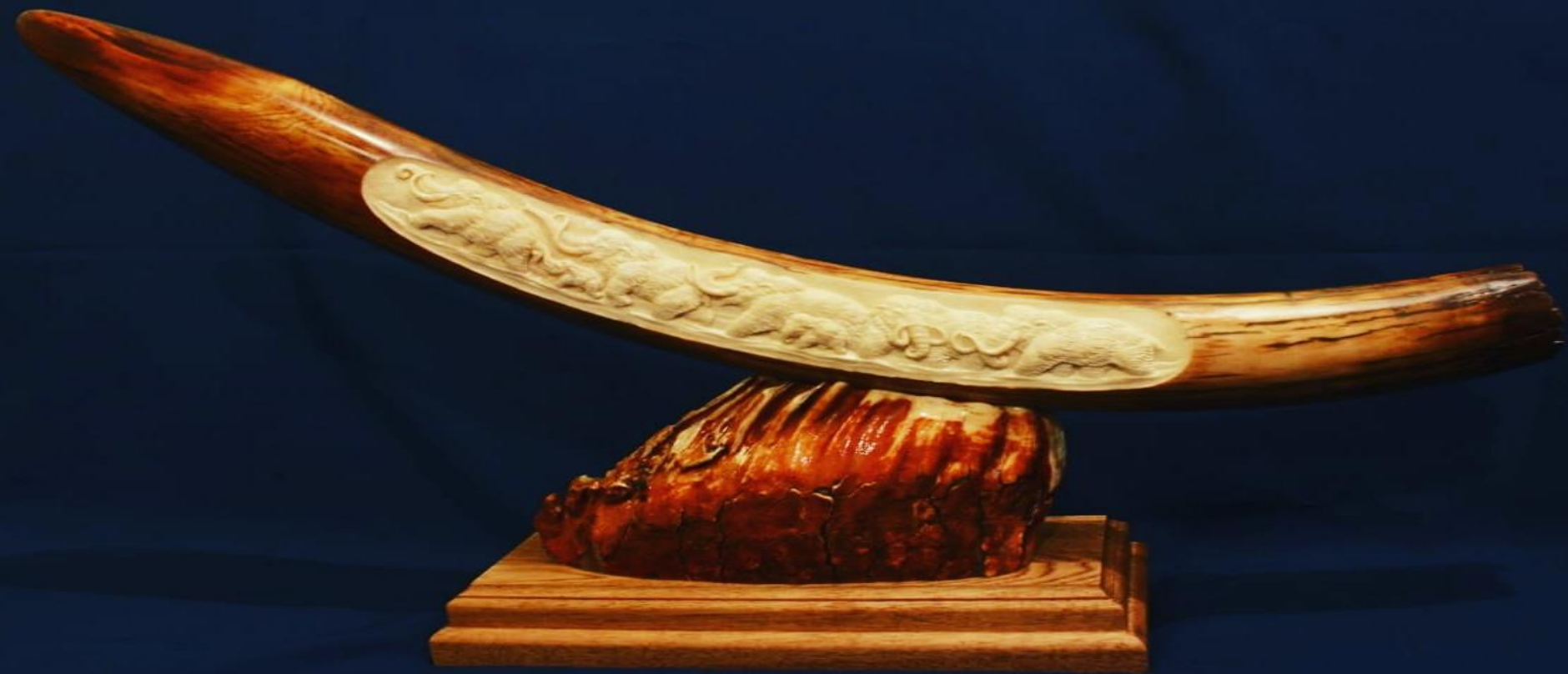
“Yakutian bone carving factory” Tusku LLC