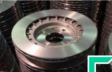
mechanical engineering and vehicle components