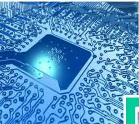
Electronics and instrumentation