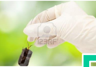
Medical technology and equipment